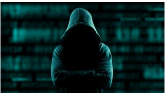
Cyber risks / Ransom-ware