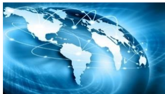
Connectivity / new business models